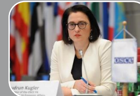
February 2022: presenter for the OSCE PA at the OSCE Economic and Environmental Forum