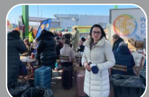
March 2022: trip to the Polish-Ukrainian border with the OSCE PA