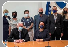
July 2021: meeting with members of the Human Rights Committee of the Bosnian Parliament