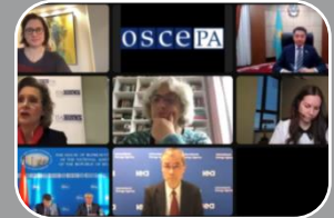
February 2022: Second Committee's parliamentary web dialogue on "The Clean Energy Revolution and its Implications for the OSCE Region"