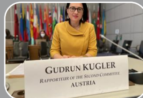
February 2022: presentation of the outline of the Second Committee's report at the Winter Meeting