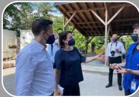
July 2021: talking to a United Nations migration official in Borici Temporary Reception Centre, Bosnia