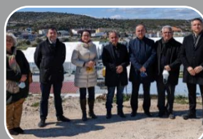
March 2022: in the asylum shelter on Lesbos, Greece