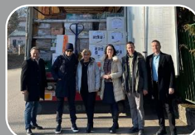
April 2022: supply transport with baby food to Ukraine, in conjunction with an OSCE PA field visit