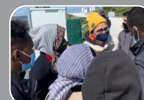
March 2022: in the asylum shelter on Samos, Greece