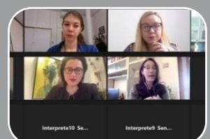
January 2022: meeting with OSCE PA Special Representative on Elderly Issues and Italian Vice-President Senator Paola Taverna