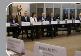
May 2022: annual Bureau Meeting and presentation of the Second Committee's annual report