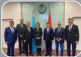
September 2021: with Kazakhstan's Delegation to the OSCE PA and Justice Minister Beketayev